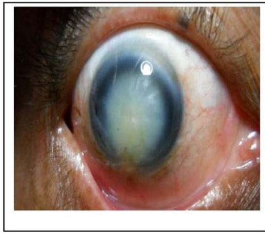
Picture 2: Pre-operative showing total aniridia and dense traumatic cataract