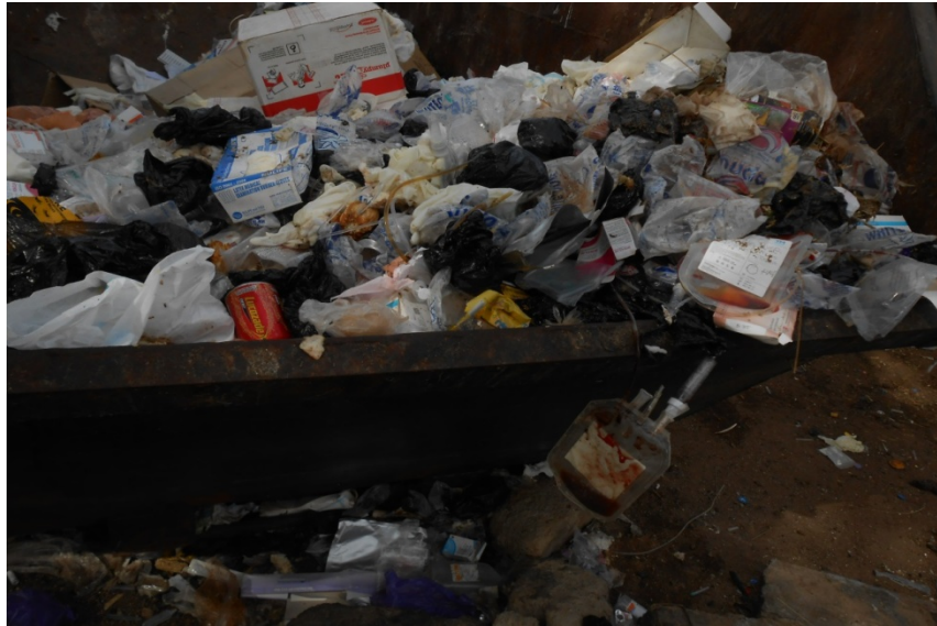
Figure 1: Mixed medical waste with ordinary waste (Source: Field survey, 2014).

Table 4 show the responses of waste workers responses on the separation of biomedical waste. Among the 15 waste workers interviewed, 13 (86.67%) indicated that waste is not separated prior to disposal to the larger storage containers in the hospital; while 2 (13.33%) responded that, the waste is separated before disposal. All the study participants said wastes from the various units are disposed into the large storage containers without segregation (See Figure 1).