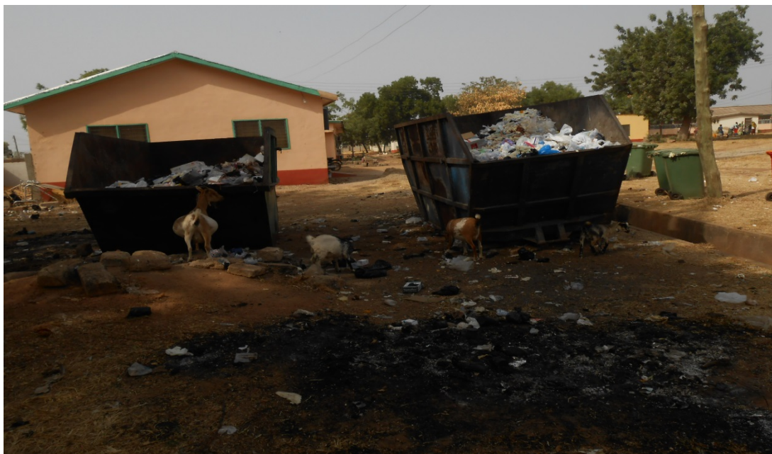
Figure 3: Waste storage place

It is clear that there is no medical waste burning inside hospital as 13 (86.67%) indicated that and the other 2 (13.33%) said they do not know. This is a positive practice and the issue respiratory problems associated with inhalation of smoke will not be a problem.