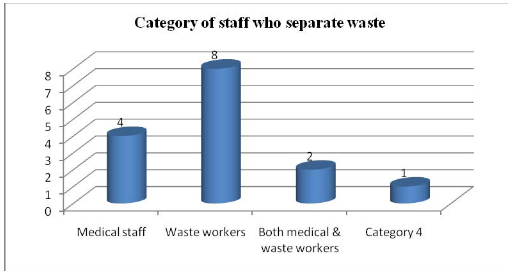
Figure 2: Category of staff who separate medical waste