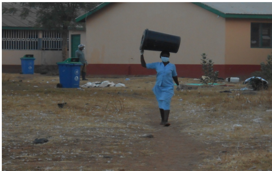
Figure 5: Waste worker carrying medical waste to storage site

With regards to the presence of means for the transfer of medical waste, all survey participants indicated that there is no means of transport to transfer waste to big storage containers from the various units. When asked how the medical waste is transported to the storage containers, they all said they carry on their heads (See Figure 5).