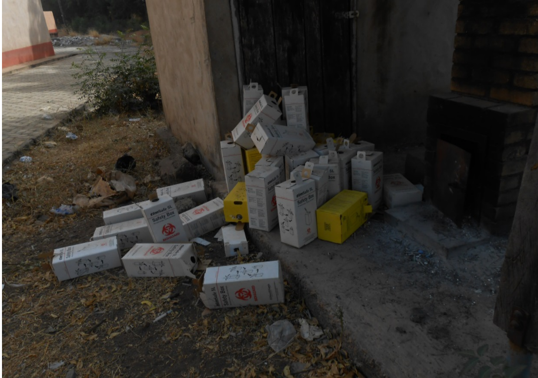
Figure 4: Safety boxes left outside the incinerated (source: field survey, 2014).