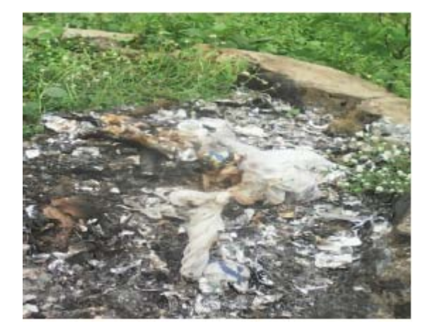
Fig 1.2 Pictorials (Pictures of improper hospital waste dumping sighted)