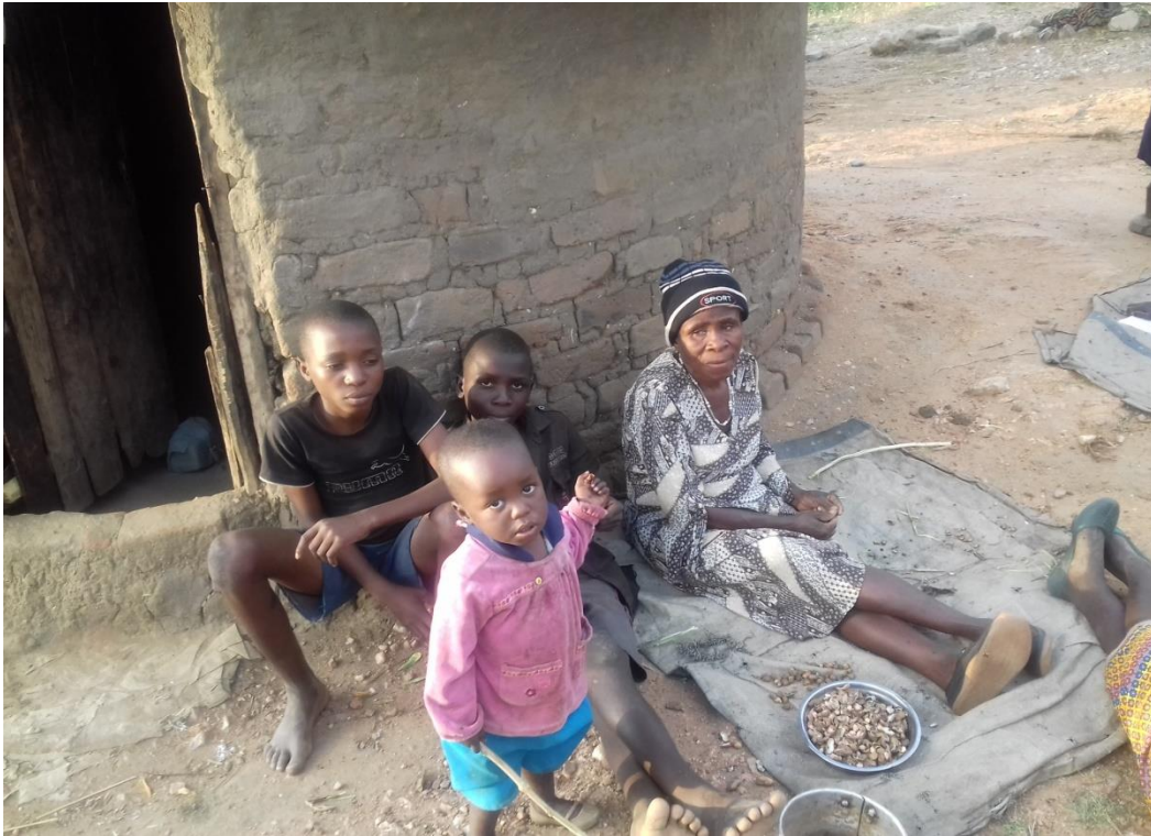
Figure 5. Measles case (Pink top)