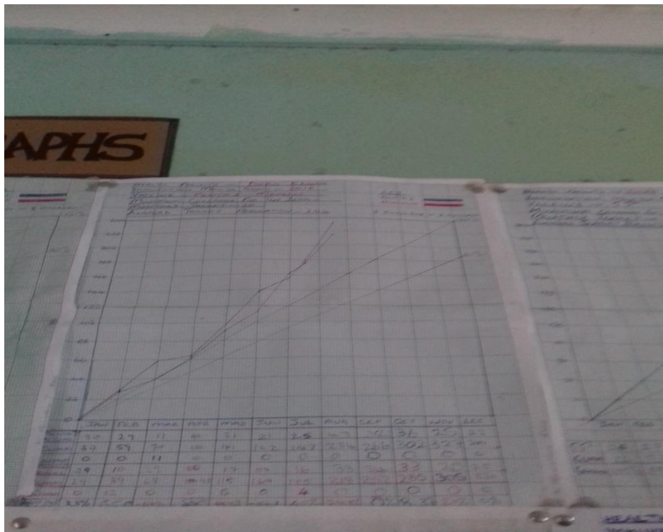
Figure 2. Vaccine monitoring graph