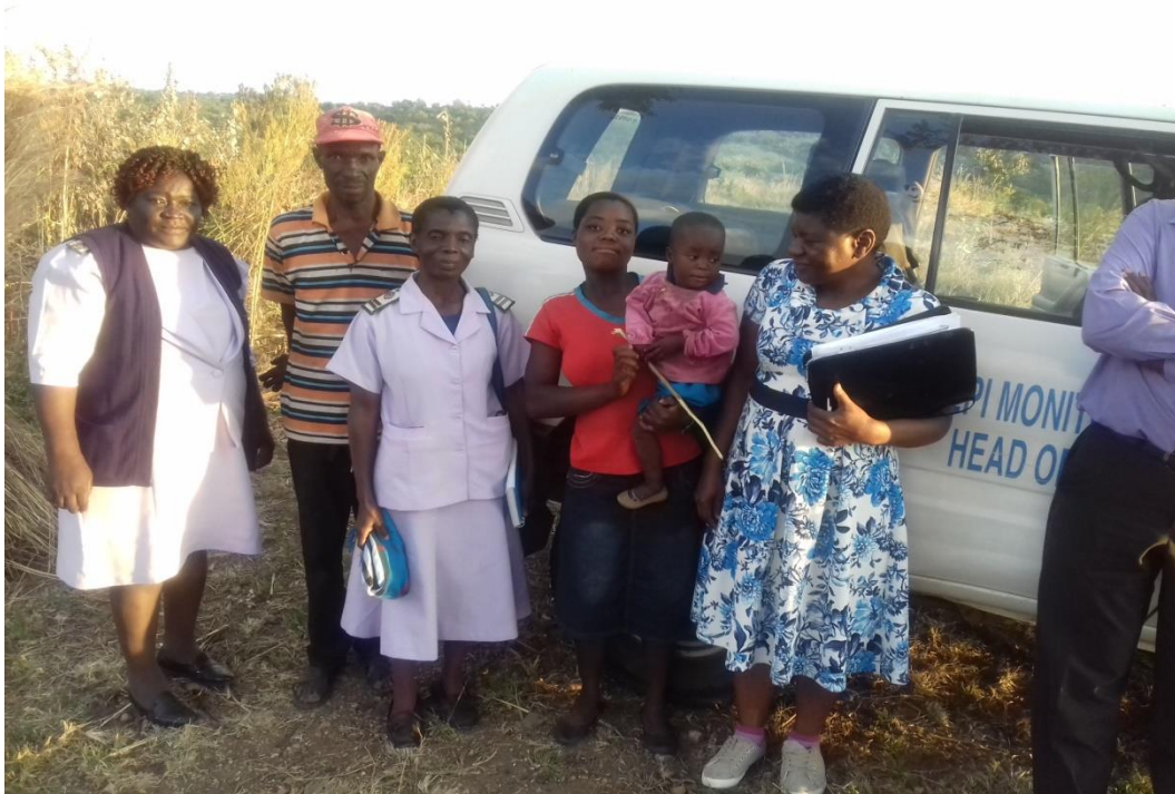
Figure 4. Interviewers and family of the case