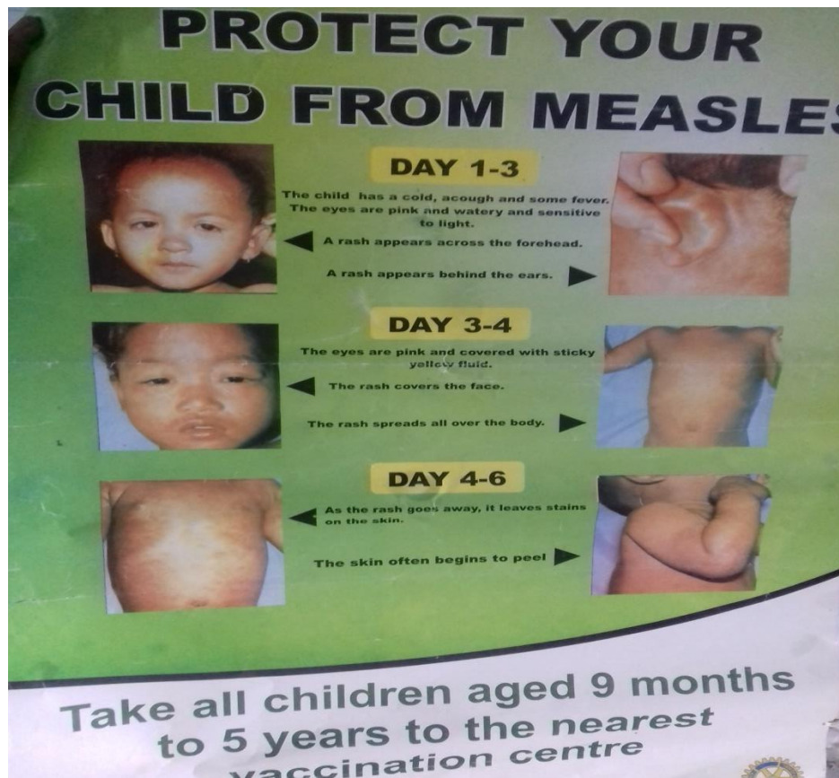
Figure 3. Measles case definition chart (WHO)