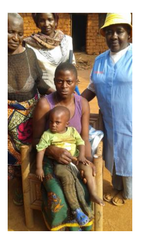
Figure. 2. A look at Poliomyelitis

NB: Pictures 1 and 2: The devastating effects of polio still noticed in some remote and very poorly accessed villages. Some of these orthopaedic anomalies are being provided supportive physiotherapy by the use of wooden crutches in a Catholic Health Centre at Mambu-Bafut in the North West Region of Cameroon. Picture 3: Recent suspected case of AFP in an Under-Five staying with the grand mother in Sob, Kumbo East, still under confirmative investigation (2014/2015 pictures).